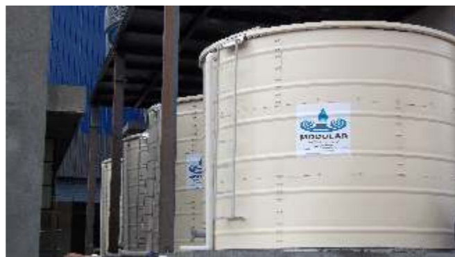
24 kl. x 4 Tanks Solapur, India