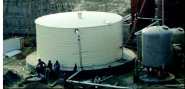
▶ Over 1.6 million Ltrs. Installed at Ludhiana, India