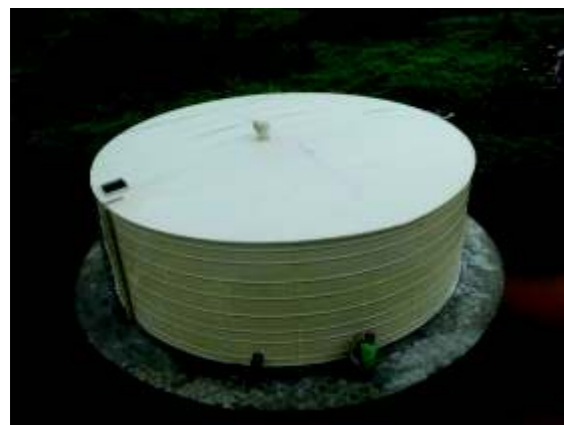
230 kl. Valsad, India