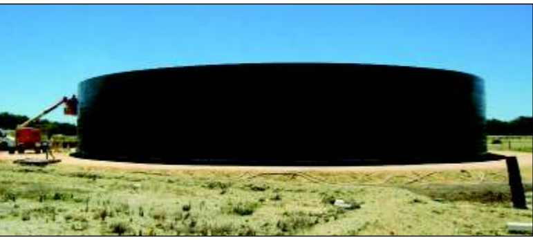
▶ 5 million Ltrs. Installed at DBC BUNBURY Australia.