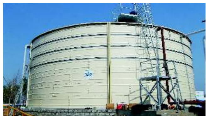
1.3 Million Ltrs. Hyderabad, India