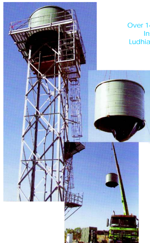
Over 140 KL Ltrs. Installed at Ludhiana, India