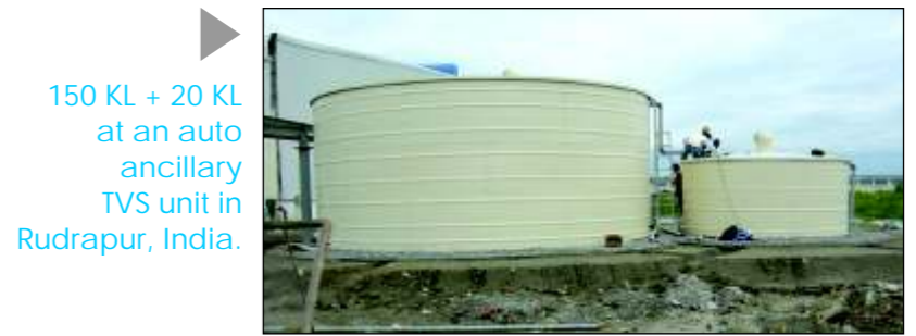
▶ 150 KL + 20 KL at an auto ancillary TVS unit in Rudrapur, India.