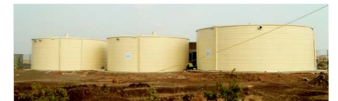
320 kl. + 208 kl. x 2 Ltrs. Baramati, India