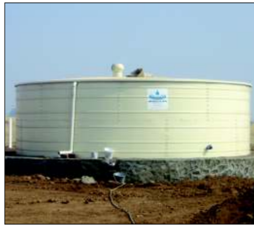
▲ 113 KL Ltrs. Installed at Pune, India