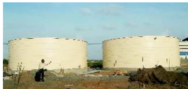
500 kl. x 2 Tanks Silvassa, India